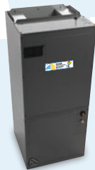
AVPEC | AVPVC | AVPTC | ASPT

* Complete warranty details available from Holtzople.com. To receive the 10-Year Parts Limited Warranty, online registration must be completed within 60 days of installation. Online registration is not required in California or Quebec.